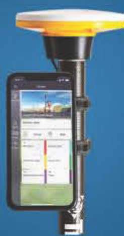
Trimble DA2 Quick Response Kit